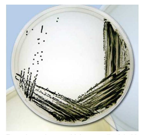
Enterobacteriacea which naturally inhabit soil, but are also naturally part of our digestive system and faeces were found only in one of those analysed Cervelats. The origin of this contamination remains unclear.

it, or leave it!" when travelling in the third world. However, most people neither know that the total plate count from a smear-test of a toilet bowl is lower than of a computer keyboard, nor that a salami sausage contains up to 108 to 1011 CFU/g of lactic acid forming bacteria - the same kind criticised in the recent analysis of Cervelats. These bacteria not only contribute to the specific flavour and taste, but also serve to out compete undesirable pathogenic bacte-ria.