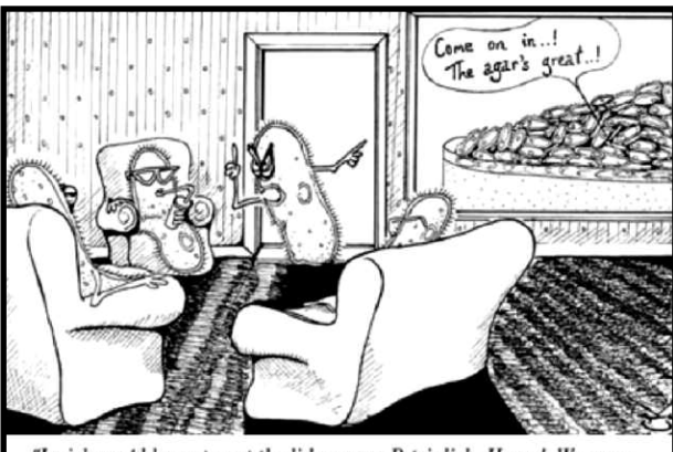
"I wish you'd learn to put the lid on your Petri dish, Harry! We came here with four kids, and now it looks like we've got twenty millon..!!"

zoom in on distribu-tors. Our food safety management and consumer protection system is based on so-called "Good Manu-facturing Practice". This implies an obligation to quality management based on hazard analysis of critical control points for all food manufacturers, and to a focus on food