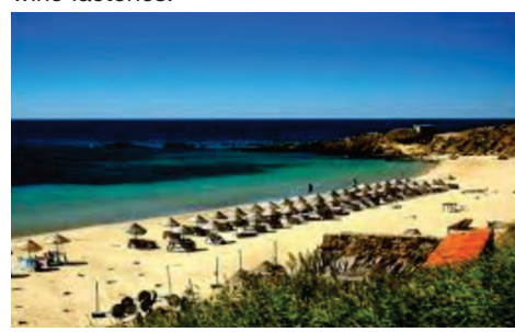
Ayazma Beach - one of the most famous beaches on the Island

who earn their living from grapes. It is the harvest season. Until the end of September the grapes are collected and brought to the wine factories.