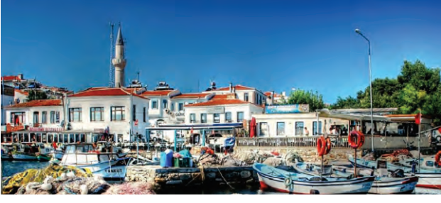
Main view of Harbor and fishing boats

Despite the booming tourism activities, Bozcaada managed to preserve its authentic look and natural beauty. If you are planing to make a trip to Bozcaada I recommend you to go in mid September. The weather will be sunny and the island will be calm because the school season begins on the first week of September.